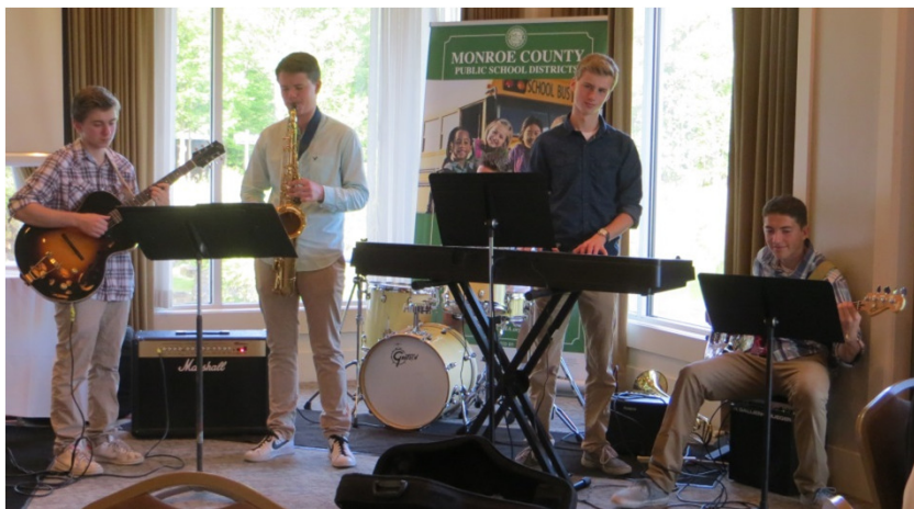
ABOVE LEFT: Penfield High School Jazz Combo performing at the Annual Meeting.