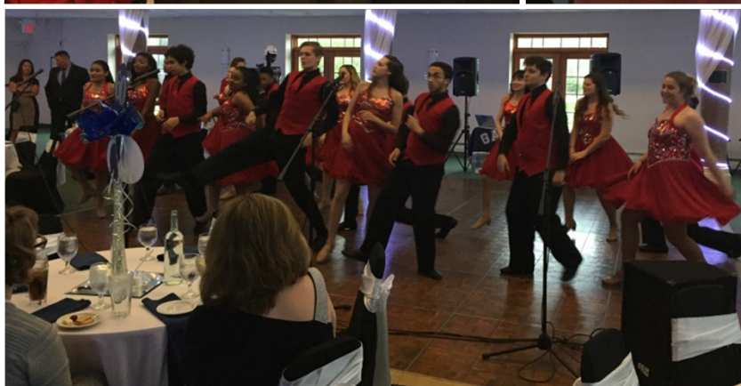
LEFT: Student performers at the anniversary party.